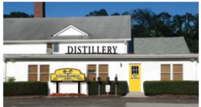
Our Tasting Room with our Vision for Signage in Spring 2014

From there we headed across town to the S&G Distillery to try some Schnapps and Apple Pie, then we walked across the parking lot to the Yellow Springs Brewery.