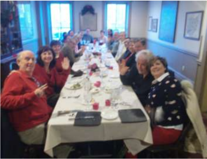
MVT'ers braving the cold for a V-Day Dinner at the Golden Lamb. Yes, the picture is fuzzy, what do you expect from a free camera?