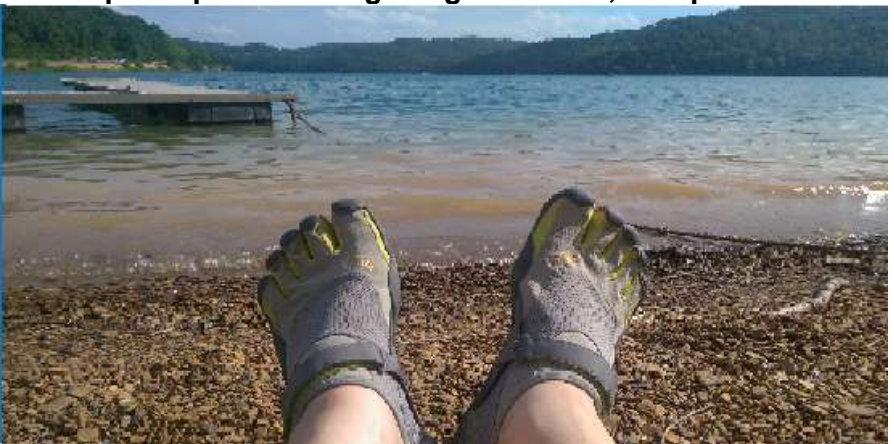
Great time – hope to see you next year at TRA2016!

July – Busy month folks – warm weather, tours, pools and getting ready for Dayton British Car Day! There also might be a pop-up tech session sometime – Allison’s Stag is calling us!