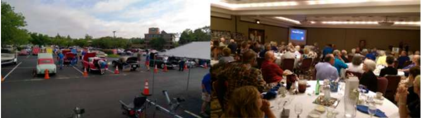
Morning of the car show – Concours participants making things beautiful, Banquet time!