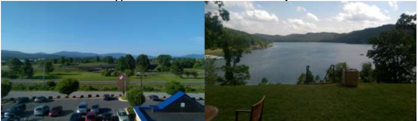
Morning shot in Waynesboro VA looking toward the Blue Ridge, evening shot at Tygart Lake in WV – everywhere we went the scenery was beautiful! Pays to go the back roads!