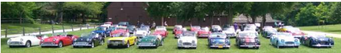
Cars of TRA2015 – I counted 42, mostly TR2-3Bs, but I thought I saw a Stag....??? Maybe 2??? Attendance down a bit this year. Some blamed the location, but I thought it was nice!