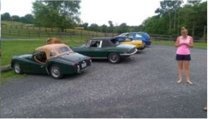
Scenic View stop in WV, and wine stop in VA – Both times Bridgett had signal....