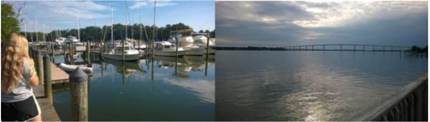
Marina at Solomons behind the hotel, Evening close to sunset from the Solomons Pier looking west at the Patuxent River Bridge