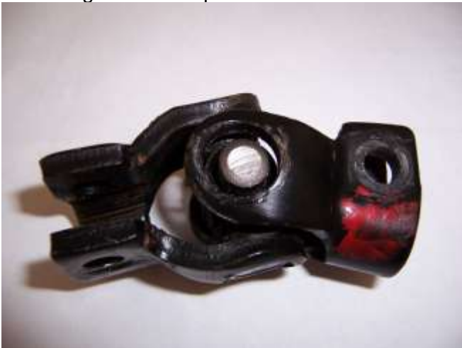
Top steering knuckle minus a bearing cup

The steering slop was due to a potentially serious issue – a steering knuckle was coming apart. One of the u-joint bearing cups was coming out on the upper knuckle. They are staked-in by several blows to the metal close to the cup and these were not enough for one cup.